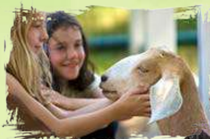
City of Edmonton