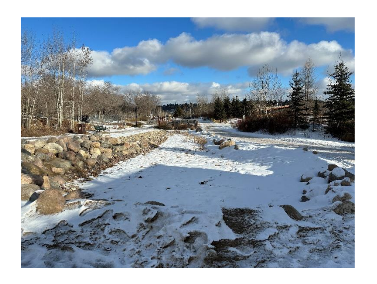
14. Manmade Wetland Bench Area