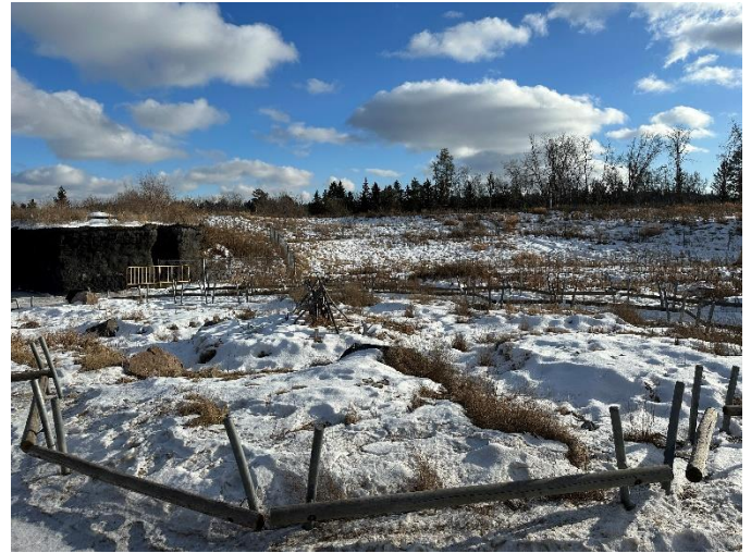
14. Arctic Shores Artifact Area or Back Field