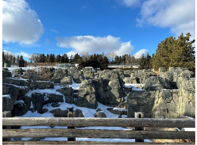
10. Meltwater Play Boulders