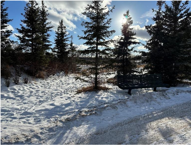
13. Manmade Wetland Bench Area