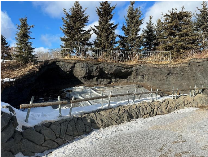
15. Empty Arctic Shores Exhibit