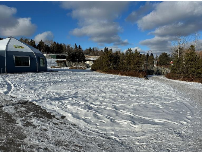
11. In Front of the Conservation Carousel