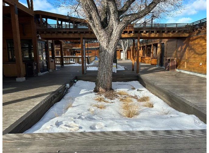
6. Urban Farm Tree Well