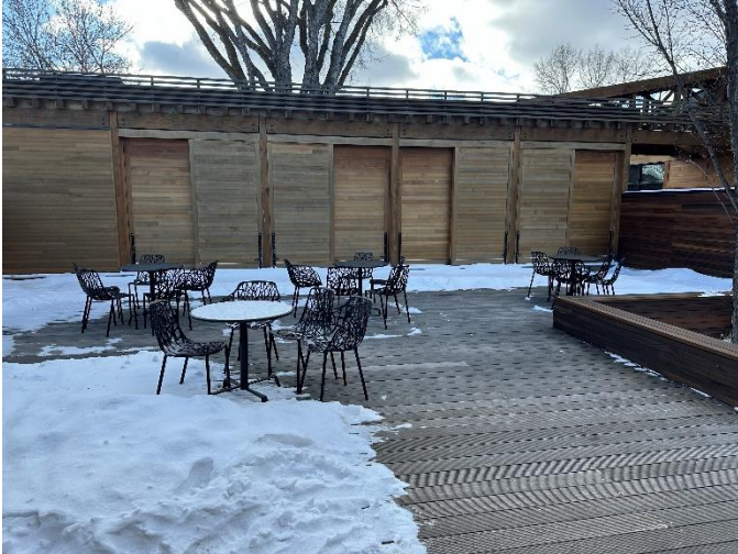
5. Red Panda Patio