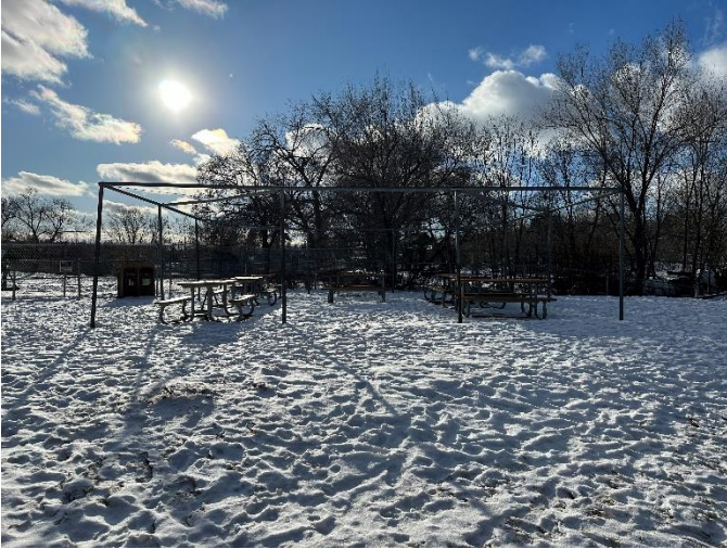
9. Zebra Canopy