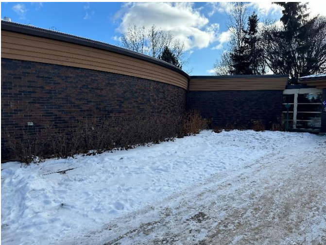
7. Outside Saito Centre Pedway Entrance